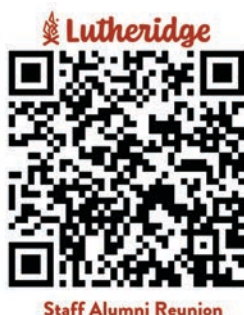
Staff Alumni Reunion

All former summer staff and their families are invited to join us for this exciting weekend. Come gather around the campfire and reminisce about summers past, and connect with old and new friends. Even if you can't come for the entire weekend, we hope you will join us for the day on Saturday.