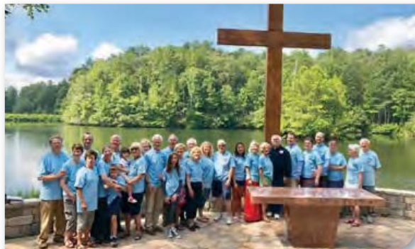
McKanna-Sandrock Family Reunion at Lutheranch

August 5, 2017 was an important day in the history of NovusWay Ministries and the Southeastern Synod of the Evangelical Lutheran Church in America as it marked the dedication of the beautiful new McKanna-Sandrock Retreat Center in Tallapoosa, Georgia.