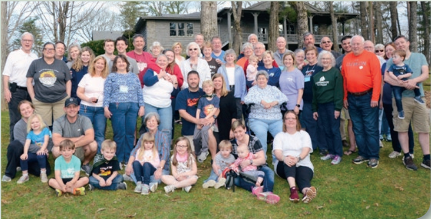
Good Shepherd Lutheran Church Members

*Lutheranch is starting up their equine program and could use donations of the above items (new or gently used). At this time they are not ready to accept donations of horses. If you would like to donate the cost of a horse in the future, approximate cost is $3,000. To purchase NEW supplies for the program, contact Mags Mobile Tack at 770-825-2203 or access this Amazon wish list link: https://amzn.to/2Hakov6 .