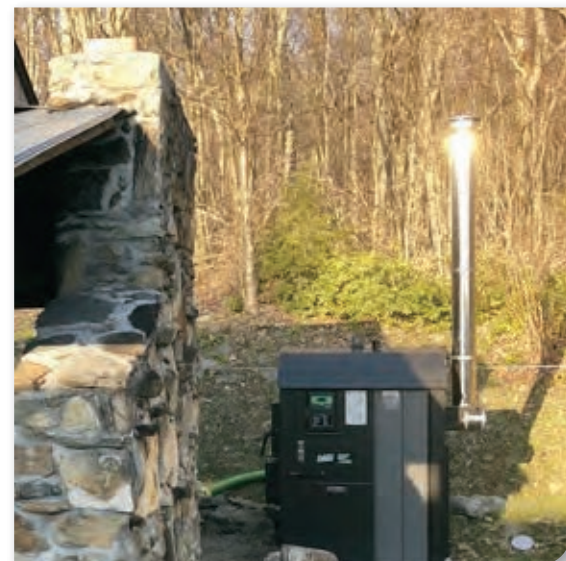
Founder's Lodge at Lutherock has a new wood boiler heat source