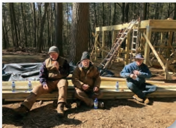
Raised tent platforms will be used by high school campers in the Outdoor Adventure Program