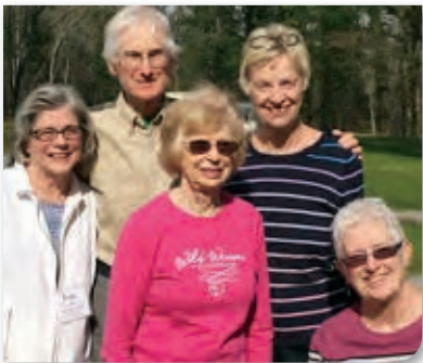
A Cousins Reunion