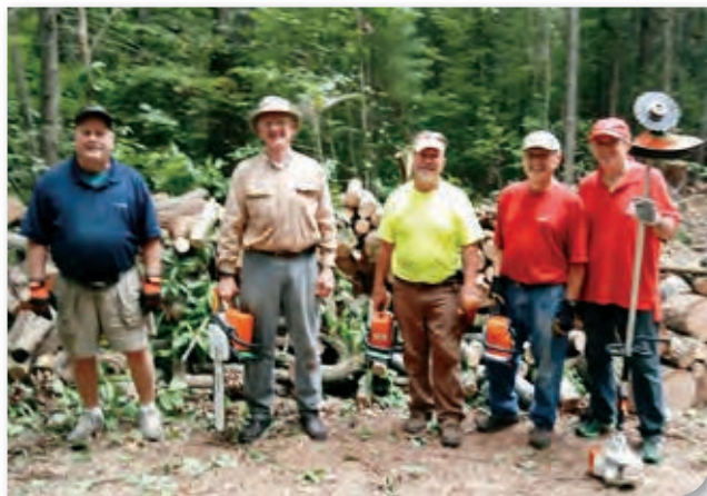
Members of St. John's Lutheran Church in Salisbury, NC have spent many volunteer hours constructing the Tent Village

A new camping area is "rising" at Lutheridge! It's the first new camping area at Lutheridge in over a decade. Among the goals and naming gifts of The Heritage Campaign, launched in July 2010, was a Tent Village and eight tent platforms.