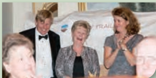
Guests enjoy the 2016 Gala

August 19 – 2 nd Annual Happy Trails Gala to raise funds to operate