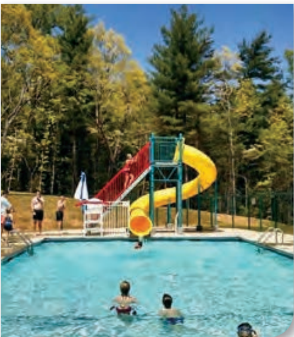
Staff alumni swimming pool