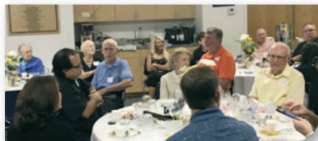
Guests enjoy a special gratitude dinner

The group was joined Saturday morning, August 11 by some 100 Luther Springs friends and donors from across the synod for a Service of Dedication and Groundbreaking. A