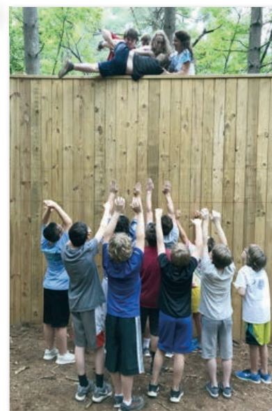
Faith Alive participants enjoy the Group Interaction Course