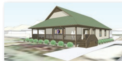
Atonement Chapel Rendering

million toward the base goal of $2.23 million. These contributions help secure the future for Luther Springs by increasing capacity by expanding facilities. This includes a fifth camper cabin in the Morgan Village, Alberta's Cabin; Alberta's Kitchen expansion; the Pauline Schmettmann Memorial Wing of additional adult housing; the Cinda Morgan Lakeside Pavilion (first of two Living Lab Outdoor School facilities for the environmental education program). Campaign contributions are also reducing Luther Springs' external debt. More funds are needed to construct and furnish the Atonement Chapel and Meeting Room, the Teaching Dock (for the Living Lab Outdoor Program), Kinports' Porch Renovation and a recreational field.