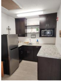
The new hospitality center located inside of the Atonement Chapel at Luther Springs.